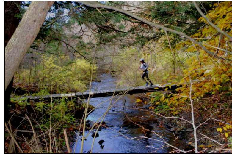
Ridgewalk and Run

The Allegany County Comprehensive Plan is a compendium of issues, ideas, situations, and proposed solutions. The intended power imparted to the Plan is testimony to our County's resolve to move our living situation forward. It is a dynamic endeavor and the planning group does hereby charge the community and its leadership with the taking of the next steps, the unification of stakeholders, amassing the resources and moving forward. Initial guidance for such movement is implicit to the comprehensive planning process. Economic security, development of infrastructure, business, and industry must unfold and flourish in concert with the preservation of our natural environment, cultural heritage, and serve to improve our quality of life.