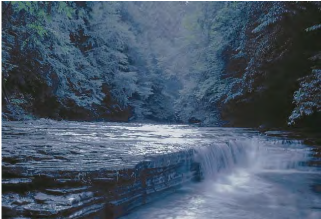
Creek in Almond