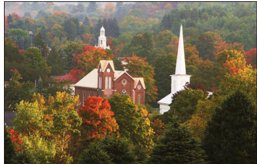
Andover in Fall