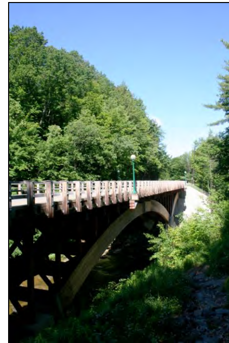
Alton Saylor Bridge over Joncy Gorge - Angelica

The Comprehensive Plan Committee accords special recognition to H. Kier Dirlam for extraordinary efforts, map creation and extra time expended in bringing the 2013 Comprehensive Plan to completion.